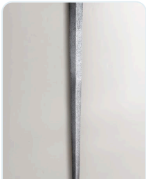
Knighthly Sword 1401–1450

/artworks?query=medieval+knight&number=3