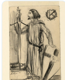
A Knight in Armor 1907